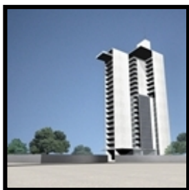
1 Model by Mackay & Partners

The consultancy has been tasked with creating a new iconic hotel, which will have a prominent skyline presence overlooking the Nairobi National Park to the south, and the city.